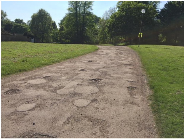
Walk to the Box Office/Start point has potholes: