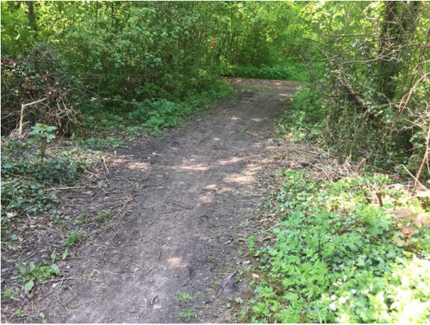
Sloped terrain entering into the woods: