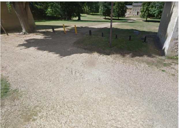
Blue Badge Parking at MK Arts Centre/Parklands with compacted gravel surface: