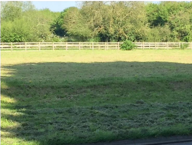
Grassy Public Parking on Marsh Drive: