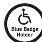
Blue Badge Parking