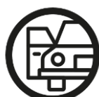
Drop Off/Pick Up Point