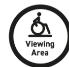
Wheelchair Viewing Area