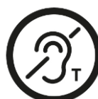
Hearing Loop Available