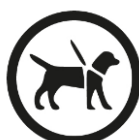
Assistance Dogs Welcome