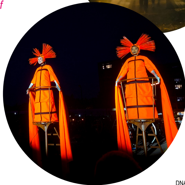
Transe Express: DNA, Vertical Odyssey