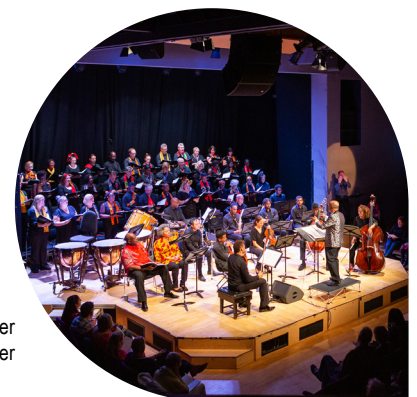
Chineke! Chamber Ensemble: Forever