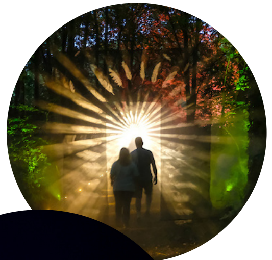
For The Birds