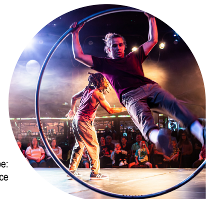
Barely Methodical Troupe: Bromance