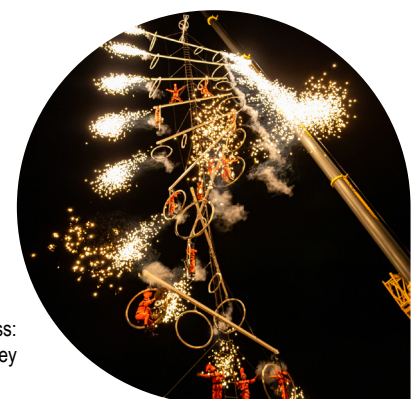
Transe Express: DNA, Vertical Odyssey